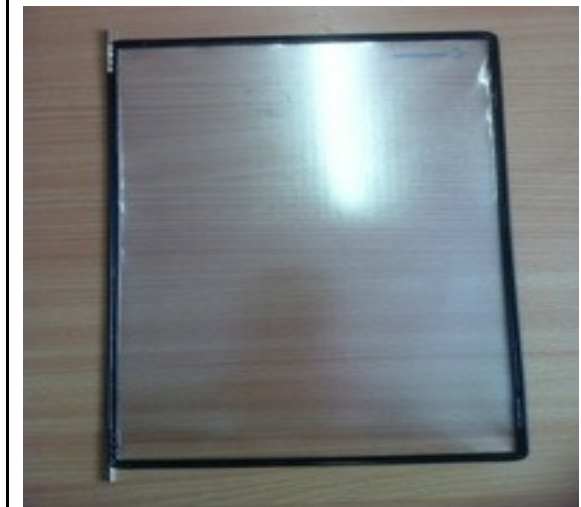
Poster Sleeve (notice the metal ends!)